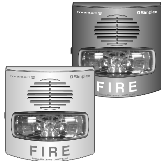
Figure 1: TrueAlert ES Addressable A/Vs are Available in Red with White Lettering and White with Red Lettering